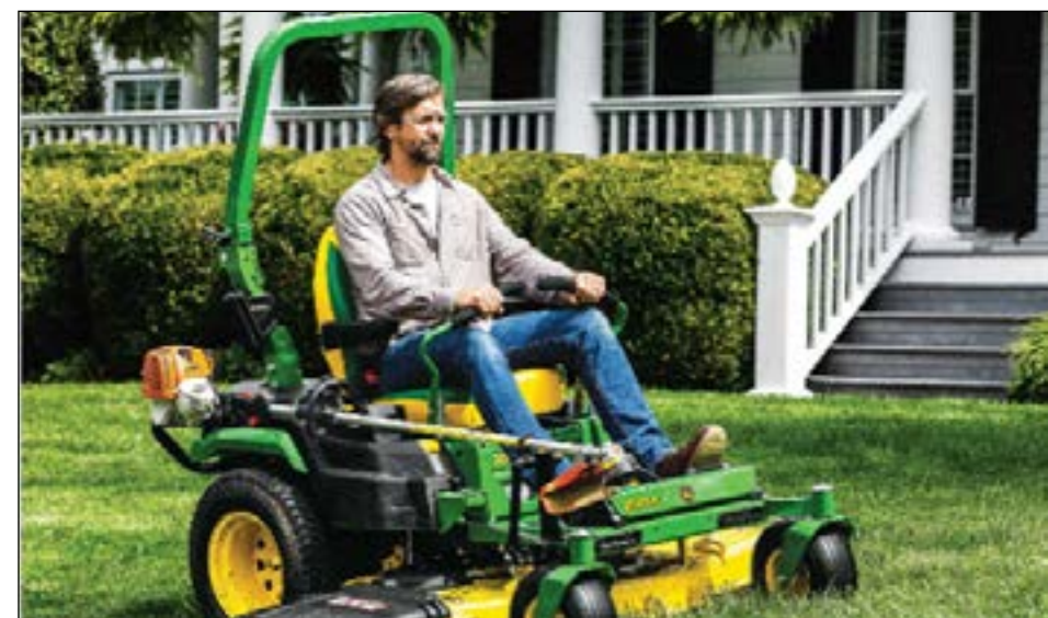
Run with Us ~ See the "Z track" series of Zero Turn Mowers (Z300, Z500, and Z700 Series)R