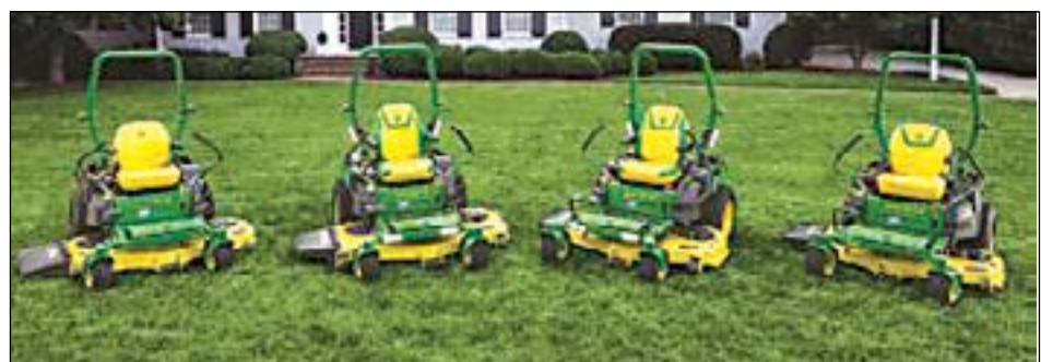
7 Models Under $3499. USD ~ Bumper to Bumper Warranty